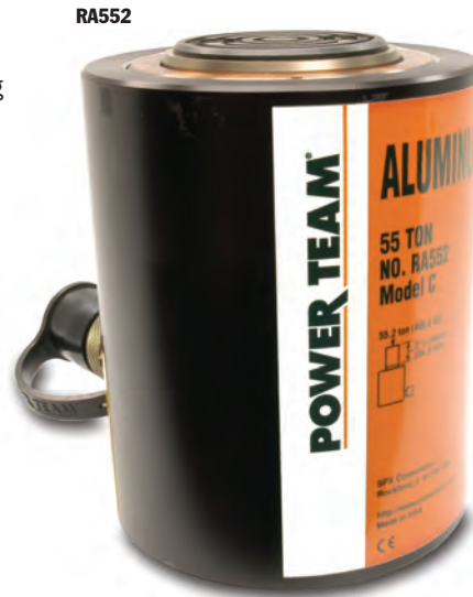
ASME B30.1 10,000 PSI