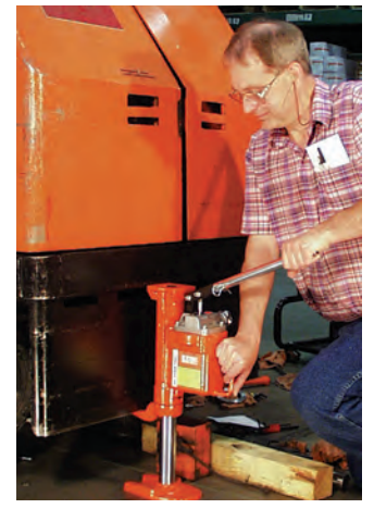
The J Series Toe Jack is an extremely rugged jack used here for lift truck service.