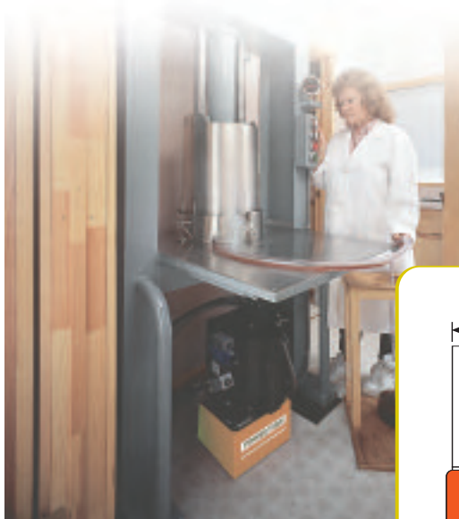
PE21 series pump and RD5513 cylinder used in a special press that produces pharmaceutical-grade extracts for herbal medicines.